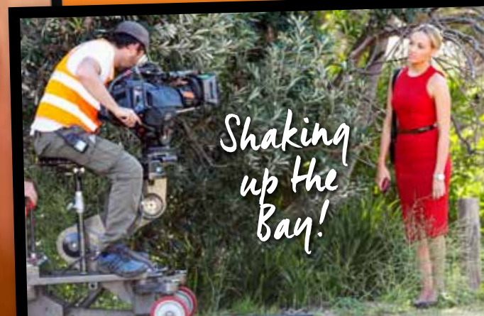
Shaking up the Bay!